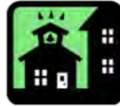
Middle School 2