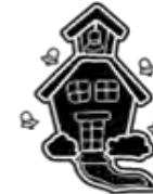
Middle School 3