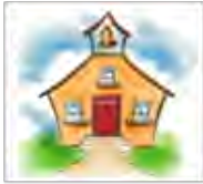
Middle School 1